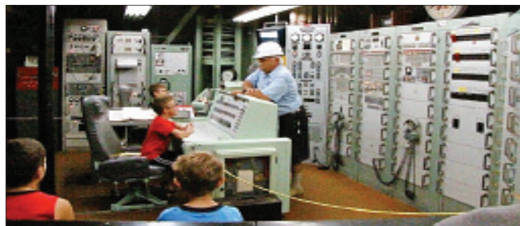
Inside The Titan Missile Museum

The Missile Museum was a blast (pun intended!). You'll get a mind-blowing