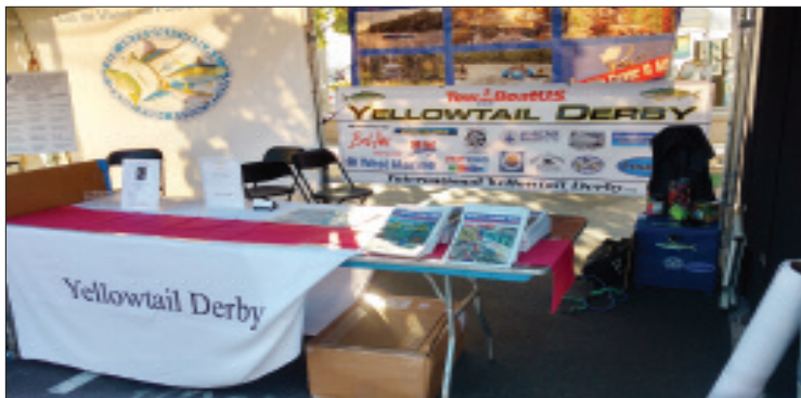
SHARED — The Yellowtail Derby and Western Outdoor Times/Arizona Boating & Watersports shared a booth at the always-popular San Diego Sportfishing event Day at the Docks on Sunday, April 17.

June 6/1 4 Weekend Prize - Sponsor - Surprise, 5 Last day of Fishing - by 6 p.m. all fish must be weighed 6. Awards Celebration at the Bali Hai