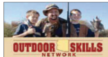
hands-on workshops teach the skills necessary to successfully pursue the variety

The Arizona Game and Fish Department offers camps on hunting basics to individuals who are interested in hunting but may not know where to start. These