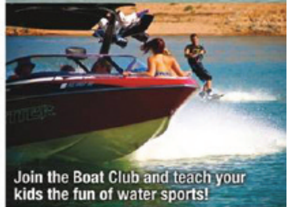
Join the Boat Club and teach your kids the fun of water sports!