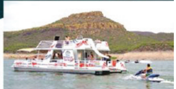
20 Passenger Party Boat!