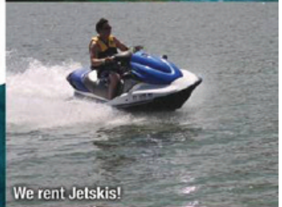
We rent Jetskis!

'Boating without the extra expenses and hassles' find out more now!