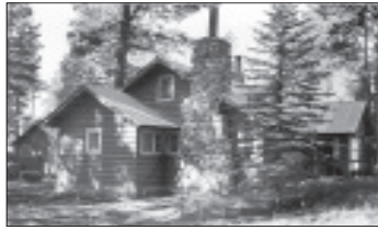
North Rim Ranger Residence

The gate at the entrance to North Rim of Grand Canyon National Park will open on Sunday, May 15 at 7:30 am; and Grand Canyon Lodge North Rim, a Forever Resorts property, and Grand Canyon Trail Rides will commence their 2016 seasonal operations. Although the gate to the North Rim of Grand Canyon National Park will not open until May 15, Arizona Department of Transportation will open Highway 67 at Jacob Lake at 1 pm on Friday, May 13.