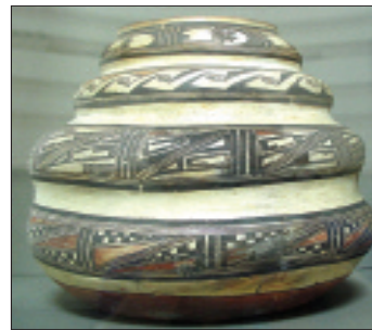
Hopi Ceramic Jar (Nampeyo, circa 1880)

Homolovi IV West Petroglyph Hike — May 7 at 9:30 a.m.: Join a Park Ranger on a hike to the Homolovi IV West Petroglyph Site. This tour will explore some of the park's prehistoric petroglyphs. The tour will require approximately 3/4 mile of walking (estimated time two hours),